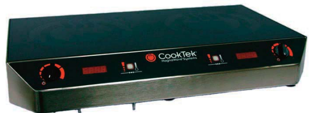
Counter-top side-by-side double burner (hob)

*3000W per burner (hob) units available outside US and Canada only