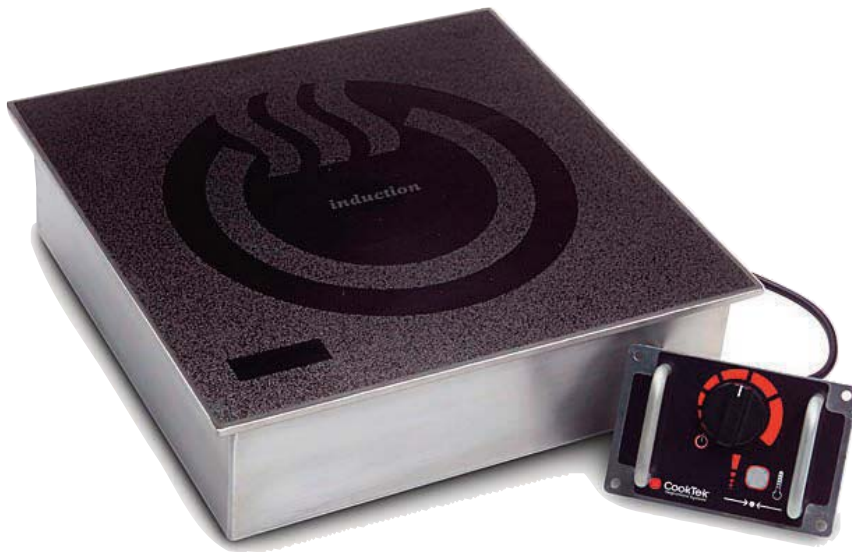
Drop-in single burner (hob)

“Standard” units feature a simple, traditional control knob and display, while “Apogee™” units offer more refinement and sophistication.