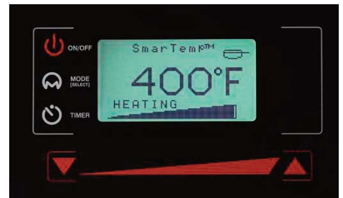
Apogee faceplate shown in temperature mode