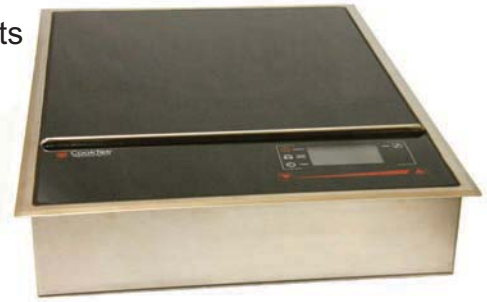
Drop-in single burner (hob)

The front panel is made of smooth, easy to clean wipe down tempered glass - no knobs or buttons to lose or break. Beautiful, bright, black and white backlit LCD information center display shows: power setting or target temperature; heating or at-temp status; the timer (when in use); and a pan indicator to confirm that an induction compatible pan is present.