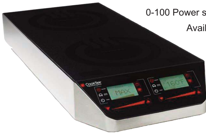
Counter-top double burner (hob)