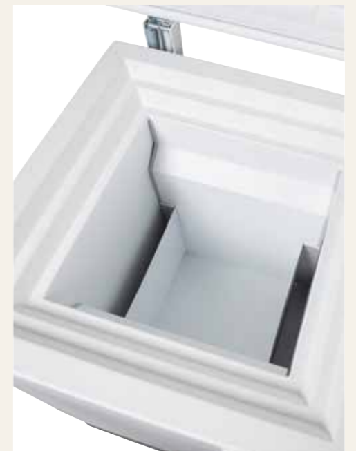
Efficient icepack freezing compartment