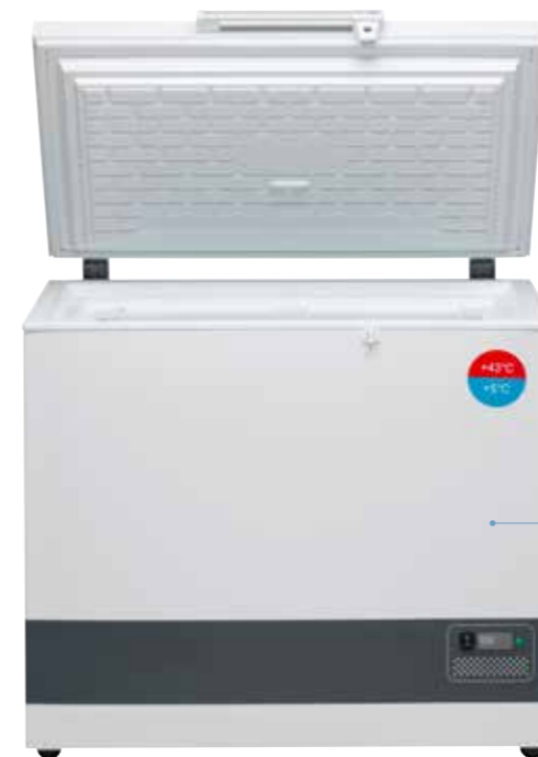
VLS 056 RF SDD - Inside

WHO PQS APPROVED WHO PQS defined three grades of freeze protection: A (user-independent), B (requiring one user intervention to prevent freezing), C (requiring more than one user intervention to prevent freezing). The Cold Chain Optimization Platform subsidizes equipment that is Grade A only, i.e., not requiring any user intervention to prevent freezing.